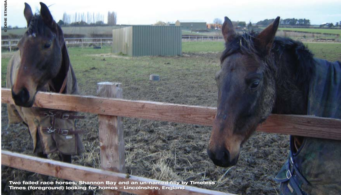
Two failed race horses, Shannon Bay and an un-named filly by Timeless Times (foreground) looking for homes - Lincolnshire, England