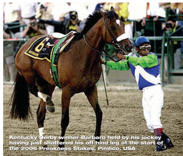
Kentucky Derby winner Barbaro held by his jockey having just shattered his off-hind leg at the start of the 2006 Preakness Stakes, Pimlico, USA

Other than in the breeding shed, stallions are kept separated from mares and other males. When not housed in their stable, they are confined behind high fences. And to minimise any chance of a costly injury, insurance policies usually state that they must not be ridden. It is a life of near isolation and deadening routine that – barring physical breakdown – can go on for 20 or more years. The 'successful' stud horse can fairly be described as being enslaved to the racing industry. He is regarded as no more than a semen-producing machine, whose own needs and troubles are of no consequence to his owner unless they interfere with his efficient functioning.