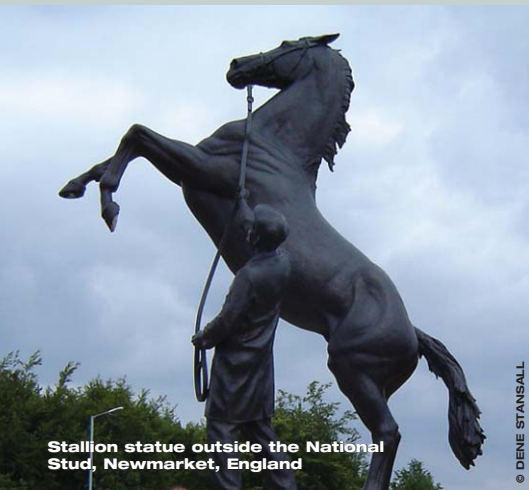
Stallion statue outside the National Stud, Newmarket, England