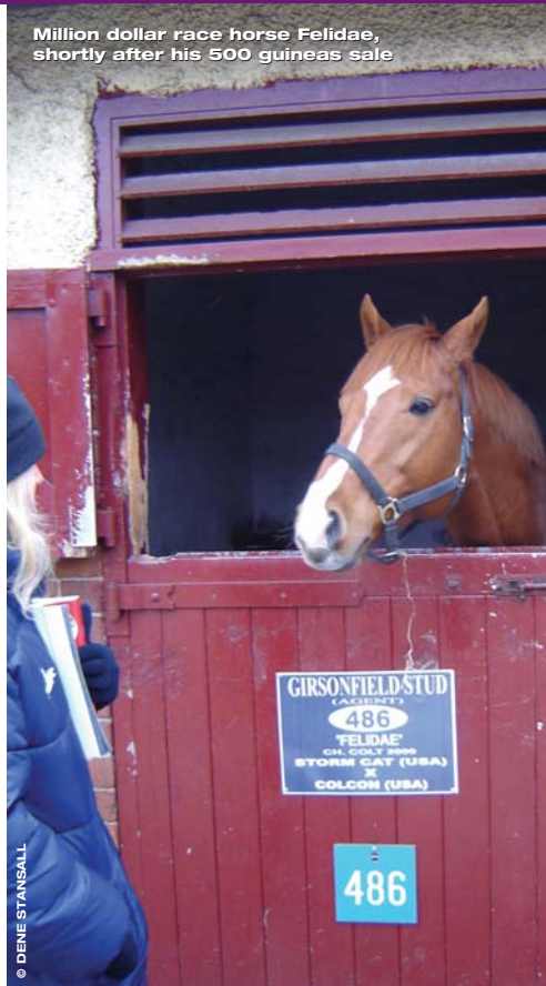
Million dollar race horse Felidae, shortly after his 500 guineas sale

Finally, he ended up at Doncaster Bloodstock Sales on February 2, 2006 and, as lot 486, was sold at a knockdown minimum price of 500 guineas. He was still only six years of age and where this riches to rags no-hoper will end up is anyone's guess. Perhaps he will meet the same fate as the horses on the facing page and be butchered for the human food chain.