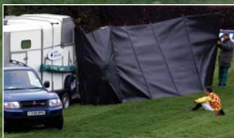
A dead race horse, and (inset) being winched into the back of a horsebox, hidden behind a screen, Sandown Park racecourse, England

Requiring flat specialists to compete over jumps can lead to serious welfare problems. This is because flat race horses are selectively bred for speed rather than for skeletal strength. Modern jump horses, as a consequence, run a considerable risk of suffering fatal injury when they do fall. The vast majority of the 370-plus horses who die while racing or in training each year in Britain are connected with National Hunt racing.