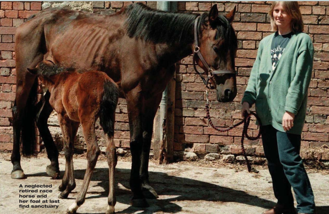
A neglected retired race horse and her foal at last find sanctuary