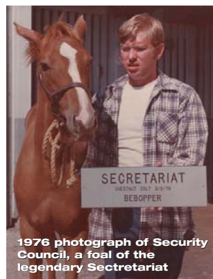
1976 photograph of Security Council, a foal of the legendary Secretariat

Even before the horses reached the age of two, ‘many’ of them had died or were untraceable. Disappointingly, the report’s authors did not specify the percentage who met this fate. There is also a mystery as to what happened to the 28% of the 1,022 horses who were exported.