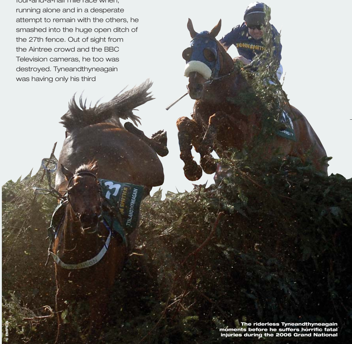
The riderless Tyneandthyeagain moments before he suffers horrific fatal injuries during the 2006 Grand National

race since coming back from an injury that had kept him out of action for almost two years.