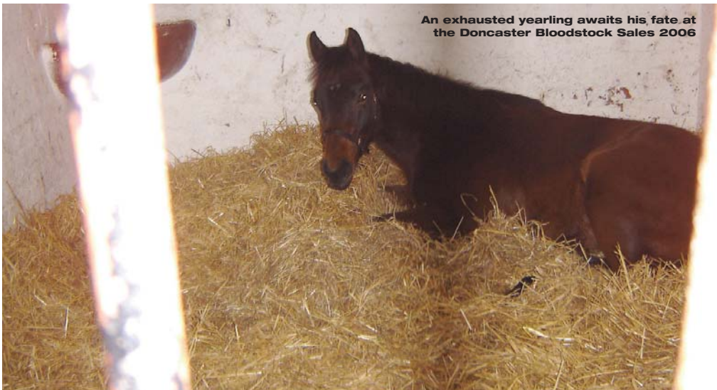
An exhausted yearling awaits his fate at the Doncaster Bloodstock Sales 2006

The world's most expensive horse, The Green Monkey, was 'pinhooked' for $425,000 before being sold seven months later – on February 28, 2006 – for $16 million (13) . The ruthless commodification of such animals is illustrated by a British bloodstock investment fund, known as Breeding Capital, among whose reported aims (14) is 'to purchase blue chip mares in foal and sell off the resulting foals at auction, generally as yearlings'. As well as buying pregnant mares and trading in their offspring, the business also purchases foals and yearlings for pinhooking at sales. Furthermore, it buys mature race horses and resells them overseas. Incredibly, the company is able to boast that 'the fund has a tax incentive under the Enterprise Investment Scheme, giving investors tax-free capital gains'.