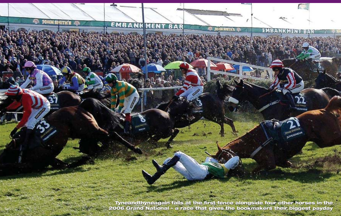
Tyneandthynegain falls at the first fence alongside four other horses in the 2006 Grand National - a race that gives the bookmakers their biggest payday

Welfare would improve for all horses through increased funding, if that funding were to be allocated fairly.